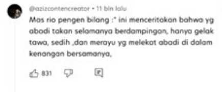
Figure 4 Netizen Comment 18 (Bunga Abadi, YouTube)

In the song "Bunga Abadi," the flower symbol serves as an emotional bridge between the singer and listener, as it is interpreted as representing the sincerity and eternity of love, capable of creating emotional closeness. Rio Clappy, via TREBEL Music's official TikTok account (August 31, 2024), explained that the song stems from his own experiences of love and emphasizes the importance of appreciating the presence of a loved one, as reflected in the lyrics, "what is the meaning of everything created without their presence here?" Analysis of netizen comments on YouTube also indicates an emotional connection formed through the flower symbol, where listeners feel the song's message of eternal love resonates with their own emotional experiences.