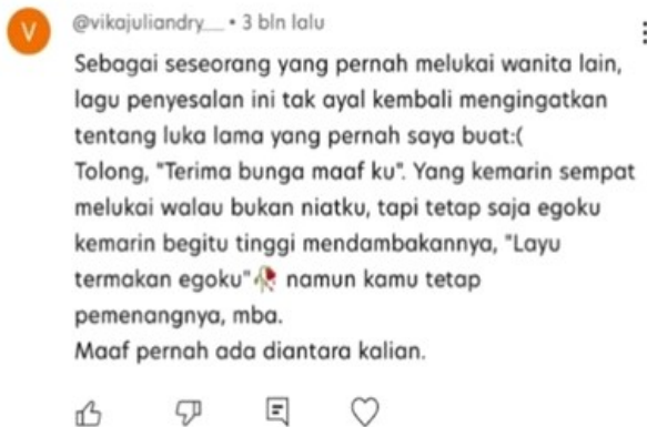
Figure 1 Netizen Comment 9 (Apology Flower, YouTube)

Based on data collected on YouTube netizens' perceptions of the meaning of flowers in the lyrics of "Bunga Maaf" by The Lantis, flowers are understood as symbols of regret, longing, and apology. What differentiates each listener's perception is the person to whom the apology is addressed. The following netizen comments clearly illustrate the meaning of flowers