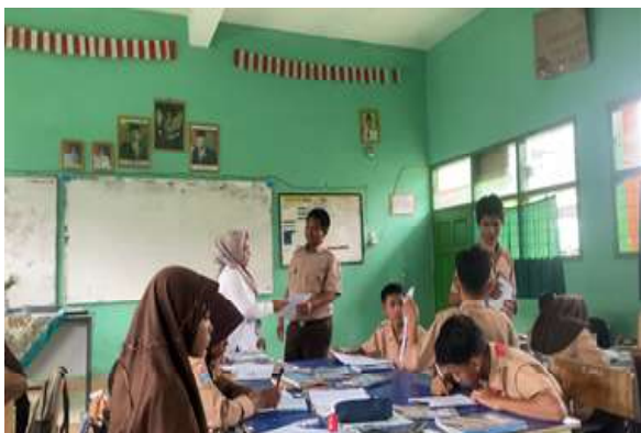
Figure 2 Suasana Belajar Menulis Cerita Pendek

In the next stage, students assigned to write a short story appeared very focused and enthusiastic in expressing the new ideas they gained from the previous King Kevin video into short stories. Researchers also observed the teacher assisting students in writing their short stories.